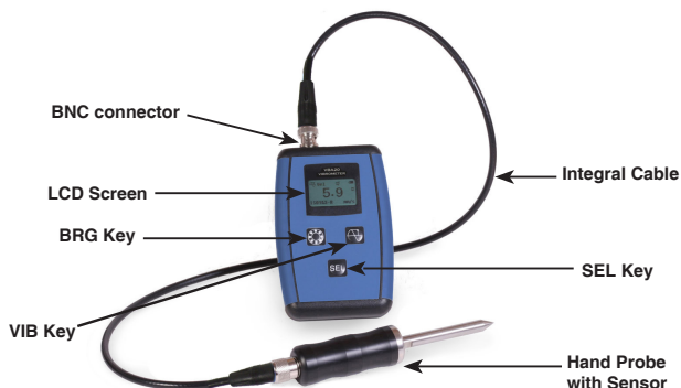
Figure 1. The VBA20