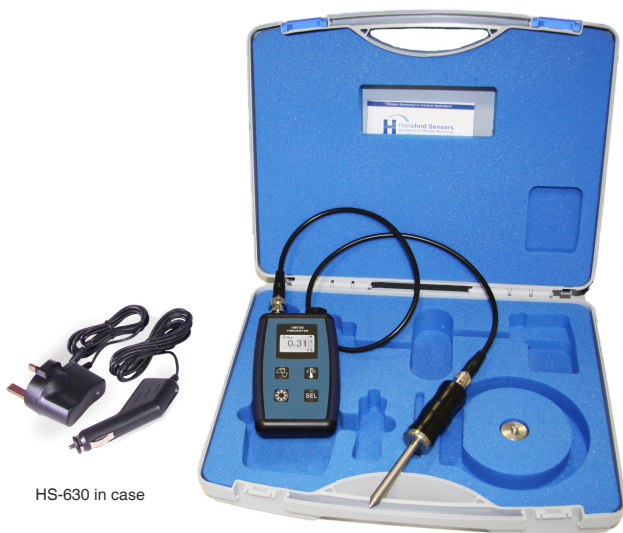
HS-630 in case